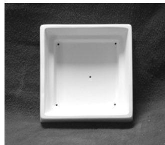
Small Square Mold # 2015 4 1/2" x 4 1/2" x 1" Deep $15.95