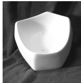
Snack dish, flat bottom Mold # 2231 5 5/8" L x 4 7/8" W x 1 1/4" Deep $22.95