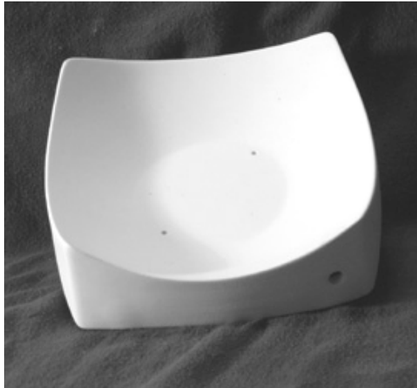
Square Candy Dish Mold # 2190 7 1/8" x 7 1/8" x 1 7/8" Deep $19.95